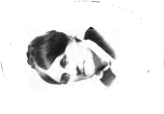
ABIGAIL MAY, MRS. A. BRONSON ALCOTT